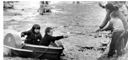
Park life. Victoria Park boat lake