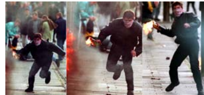
Drumcree: Petrol bomber on Garvaghy Rd