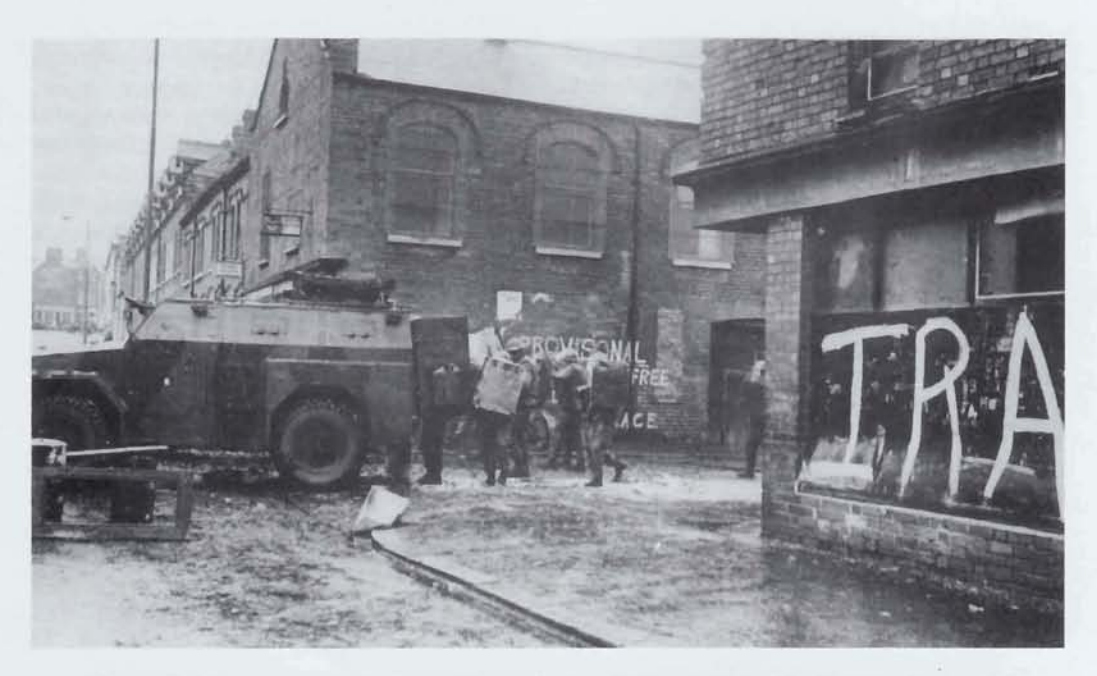
Circle Club at the corner of Edlingham Street & The New Lodge Road, circa 1973