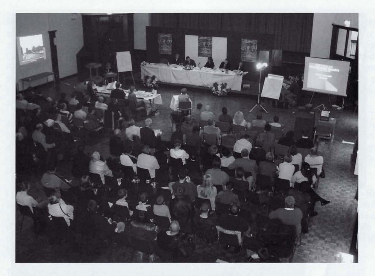
New Lodge Six Community Inquiry