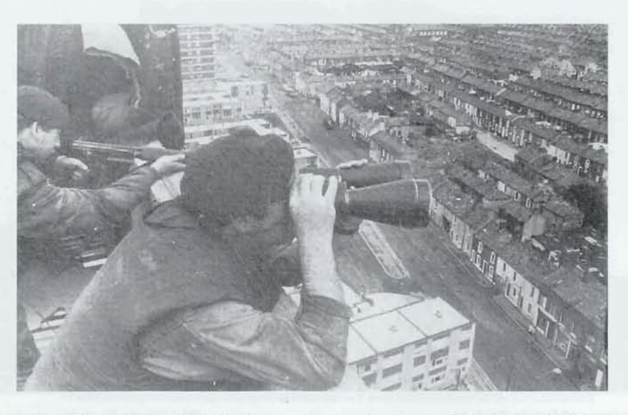
Soldiers at top of flats looking on to the New Lodge Road, circa 1973