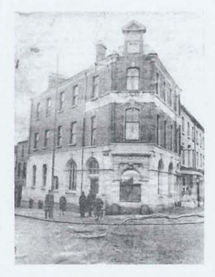
Lynch's Bar circa 1973, Junction of New Lodge & Antrim Road