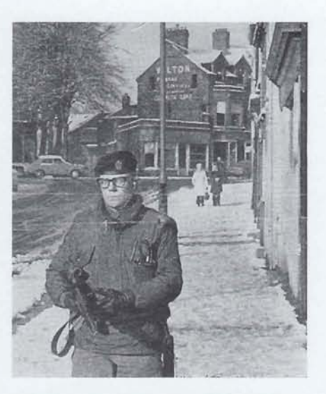
Facing North on New Lodge Road Lyceum Theatre Entrance on Right