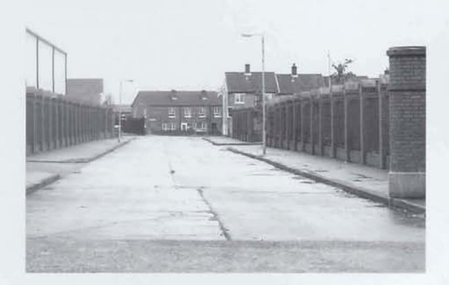
Edlingham Street entrance from Duncairn Gardens to Tigers Bay November 2002