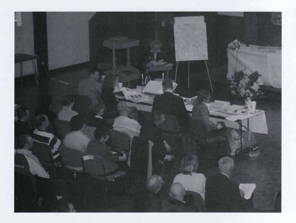
Madden & Finucane legal team presenting evidence