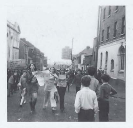
Facing South on New Lodge Road Lyceum to Left, Lynch's Bar to Right