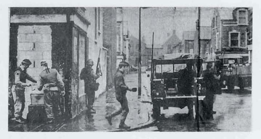
Edlingham Street running towards New Lodge Road, circa 1973