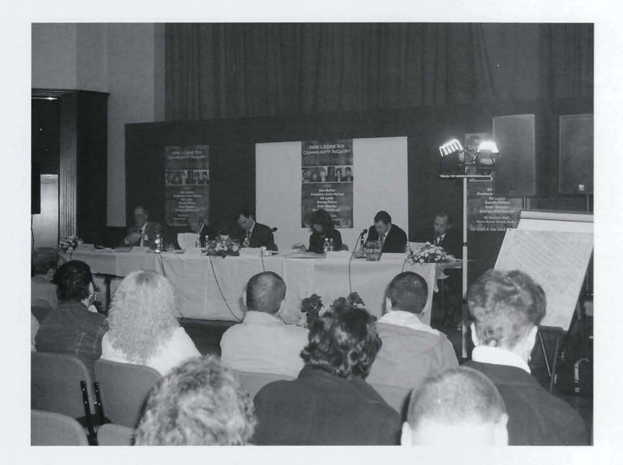
International panel of jurists taking evidence