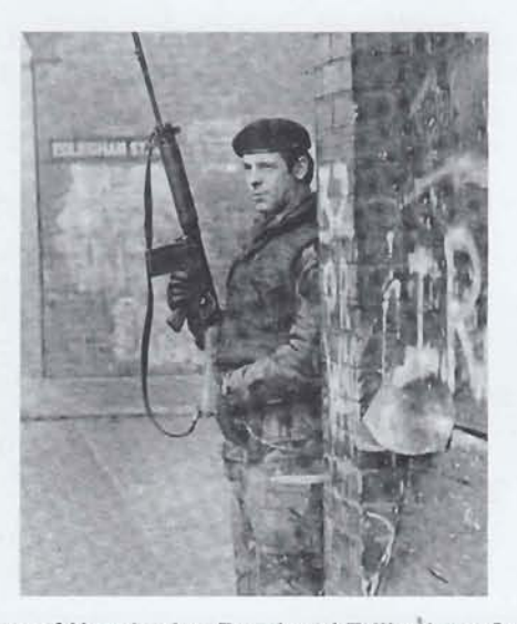
Junction of New Lodge Road and Edlingham Street, circa 1973, where four of the men were shot dead.