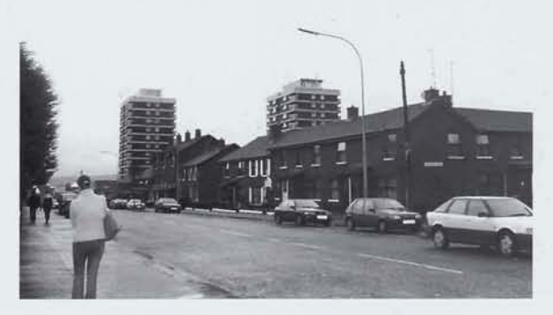
View from doorway of Circle Club to the Flats, November 2002