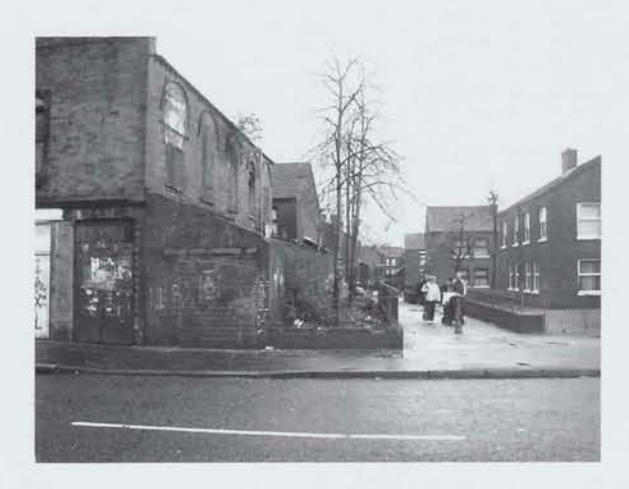
Edlingham Street running to Duncairn Gardens November 2002