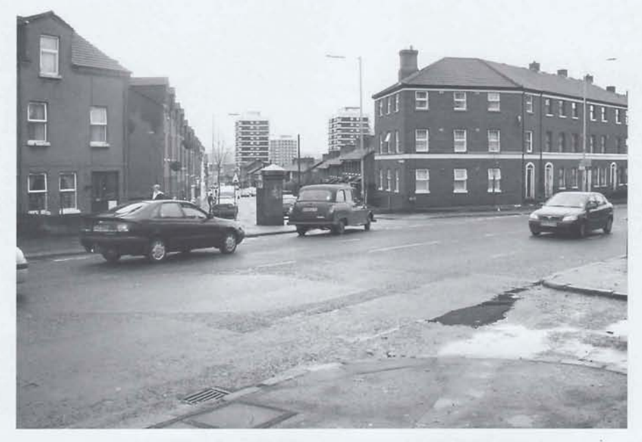
Junction of New Lodge Road & Antrim Road Present Day