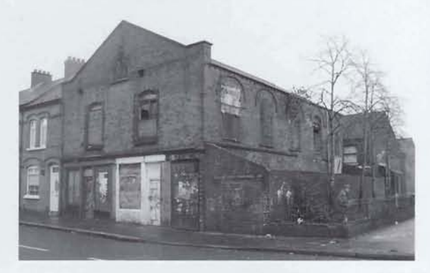
Old Circle Club November 2002, where Ambrose Hardy was shot