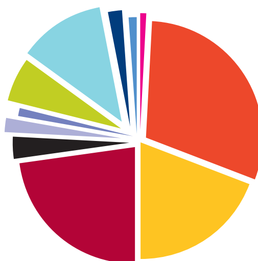
Figure 2: Proportional breakdown of total service visit costs (£27.3 million) among individuals with PTSD in 2008

Abbreviations : MH = Mental Health / HS = Health Service