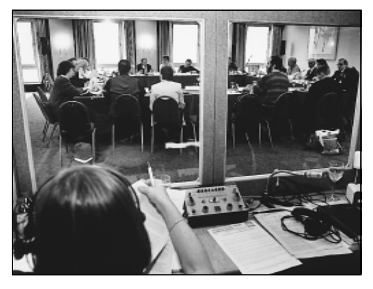
A matter of interpretation

e live in a world of multiple identities and we regard the ideal political system as the one that permits them widest expression. Reality